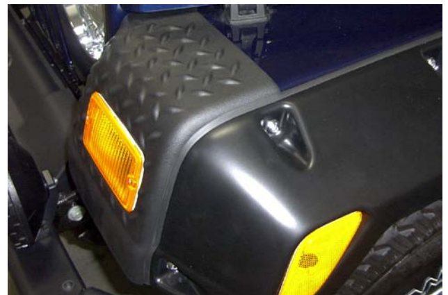
Photo #4 – Front Corner edge is under new Bushwacker Wiper-Style Edge Trim