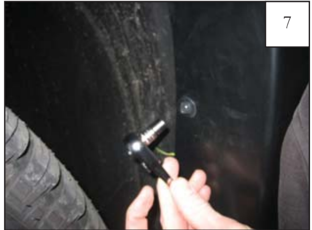
Holding flare in position on fender, reinstall factory screws removed in Step 4.