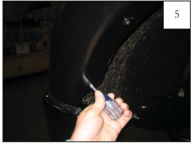
Using a #2 Phillips Screwdriver, install two supplied Tufloks (RV1-P001) through additional holes in flare and into fender. NOTE: Use a push-twist motion.