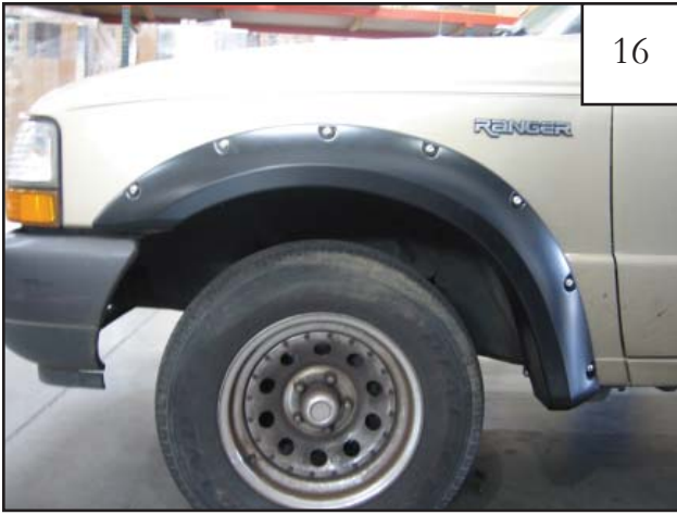
Completed front flare installation.