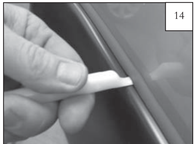
Using supplied Edge Trim Tool (ET1-0002), seat edge trim against vehicle by hooking curved end under edge trim at one end of flare. Next, slide around outer edge of flare to the other end.