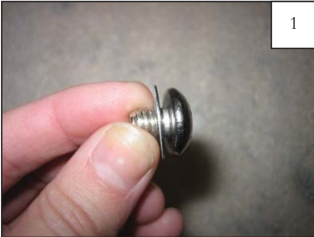
Put a Washer (WA1-0010) on each Bolt (SW1-0059).