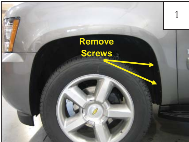
Using a 9/32" socket, remove two factory screws. Retain screws for later use.