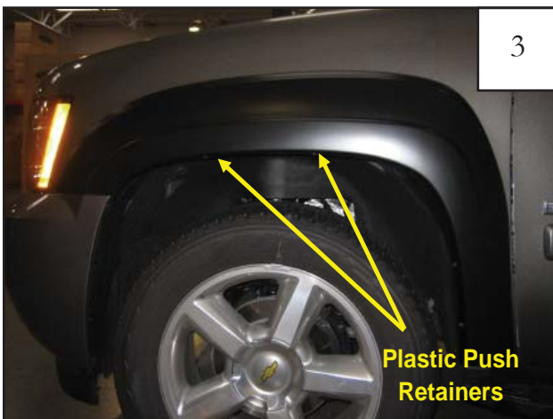
Plastic Push Retainer locations.