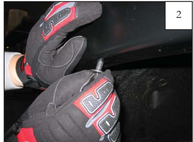
Holding flare in position on fender, install two supplied Plastic Push Retainer.