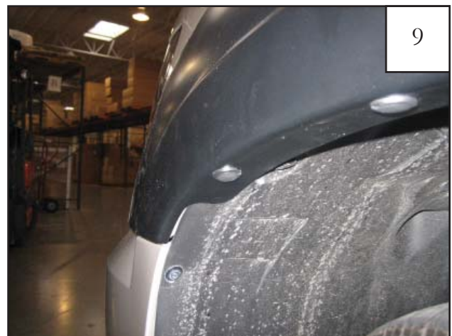
Using hole located in forward portion of flare as a guide, drill through the splash shield with a 5/16" bit. Holes in flare and splash shield should align with factory hole located in fender.