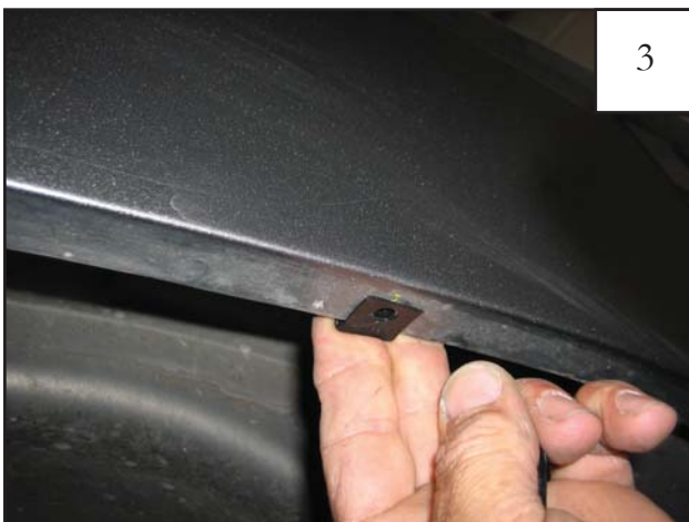
Slide a supplied Plastic Clip over two top marks made in Step 1. Clips may need to be adjusted to align with holes in flare. NOTE: the raised collar on the clip should face upward into the interior of the fender.