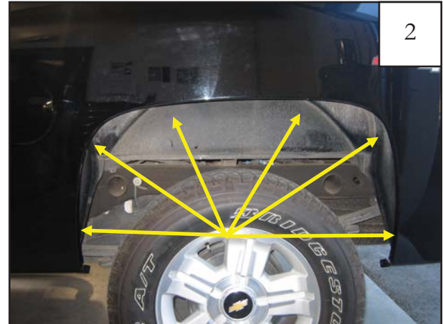
Six hole locations.