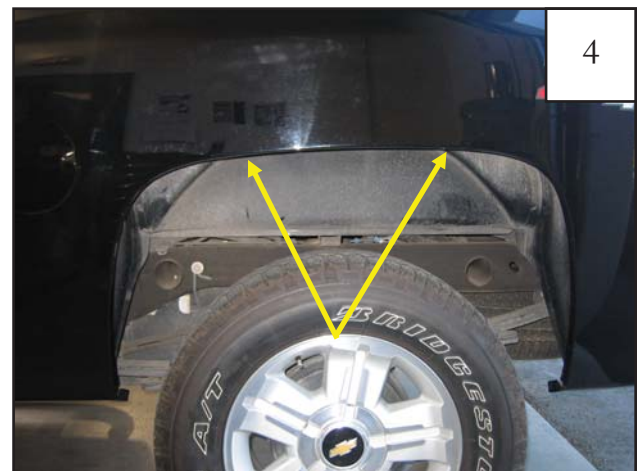
Plastic Clip locations.