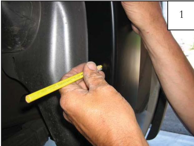
Holding flare in position on fender, use a grease pencil to mark six hole locations.