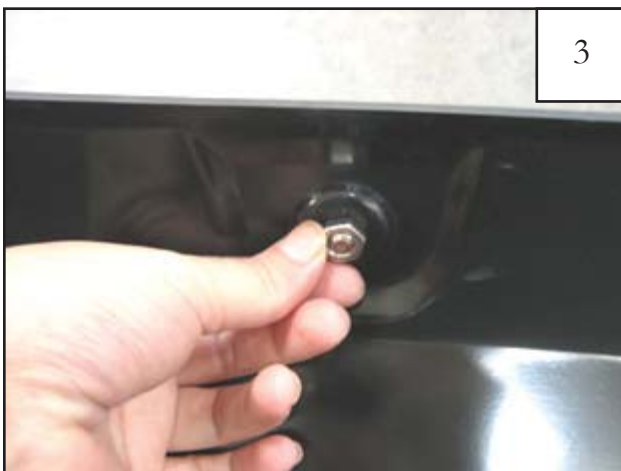
Place a Nut (NU1-0019) over the end of each Bolt and tighten, using a 1/2" wrench for the Nut and the supplied Torx Bit (SW1-0052) for the Bolt. Repeat for remaining pockets.