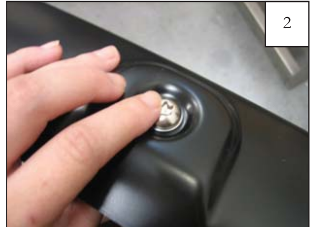
Put each Bolt through a pocket hole in the flare, bolt head on the outside.