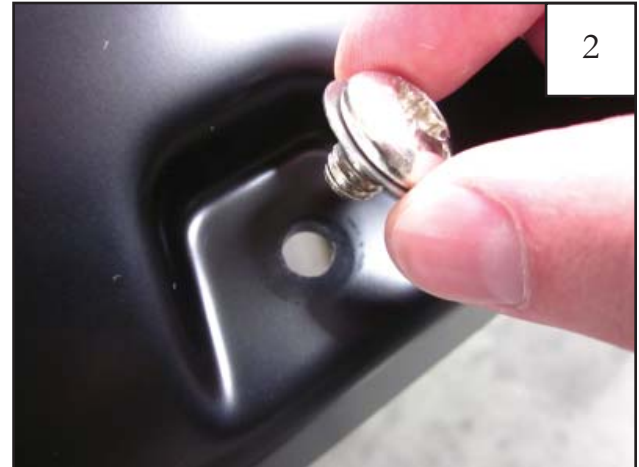
Put each Bolt/Washer combination through a pocket hole in the flare, Bolt head and Washer on the outside.