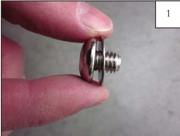
Put a Washer (WA1-0012) on each Bolt (SW1-0059).