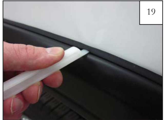
Using flat end of supplied Edge Trim Tool (ET1-0002), seat edge trim against flare by inserting straight end between edge trim and flare at one end. Next, slide around entire edge to the other end.