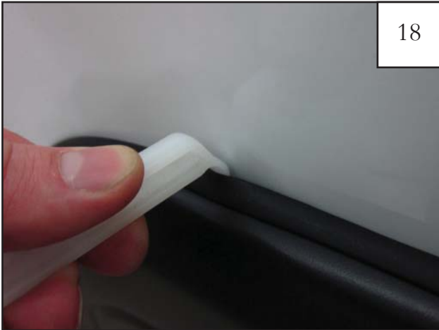
Using supplied Edge Trim Tool (ET1-0002), seat edge trim against vehicle by hooking curved end under edge trim at one end of flare. Next, slide around outer edge of flare to the other end.