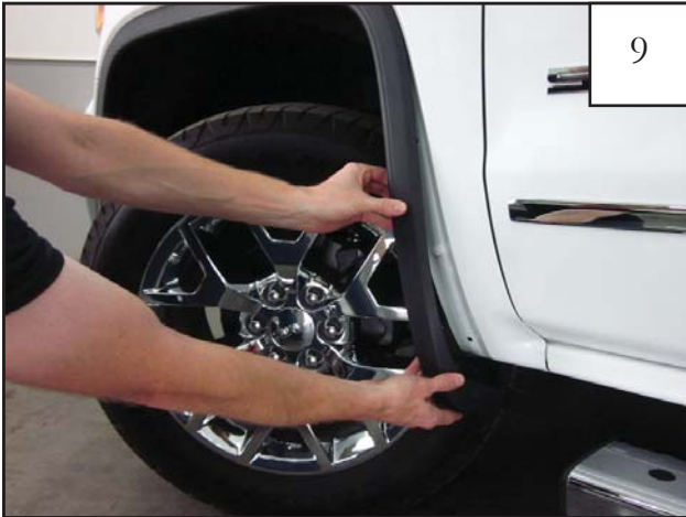
Starting at the lower rear end of the factory flare, firmly grip part and pull to remove from vehicle. Note: You will hear popping sounds as the factory fasteners release from vehicle. This is normal.