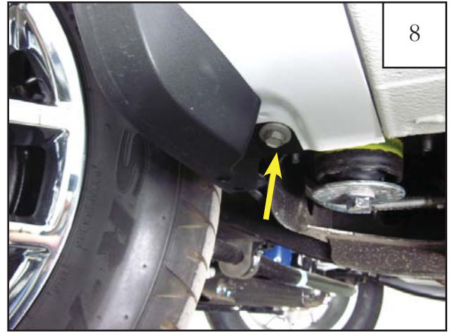
Remove fastener from rear underside of factory wheel arch molding using a 1/2" socket and wrench. Save for reinstallation.