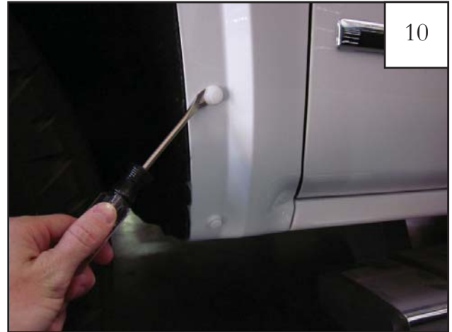
Use a pry tool to remove any remaining factory fasteners that may have stayed on the vehicle during the removal process.