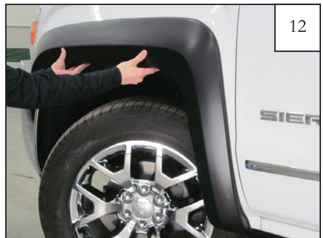
Hold Front Flare up to wheel well to confirm fit. Do not install fasteners at this time.