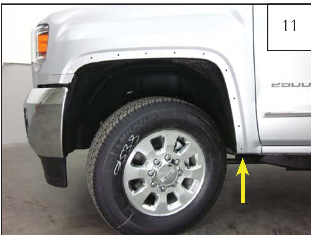
Reinstall factory fastener removed in step 9 using a 1/2" socket and wrench.