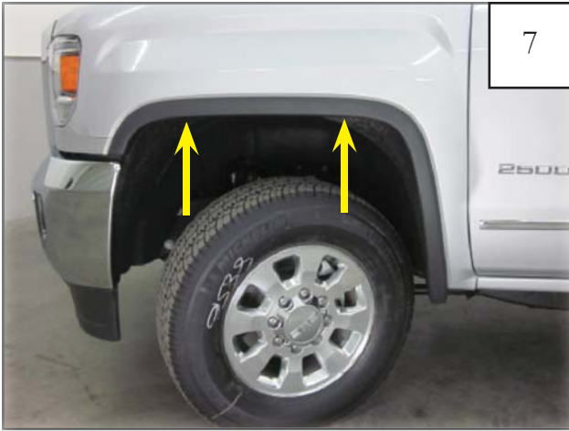
Remove two fasteners along top of factory wheel arch molding using a T-15 Torx bit.