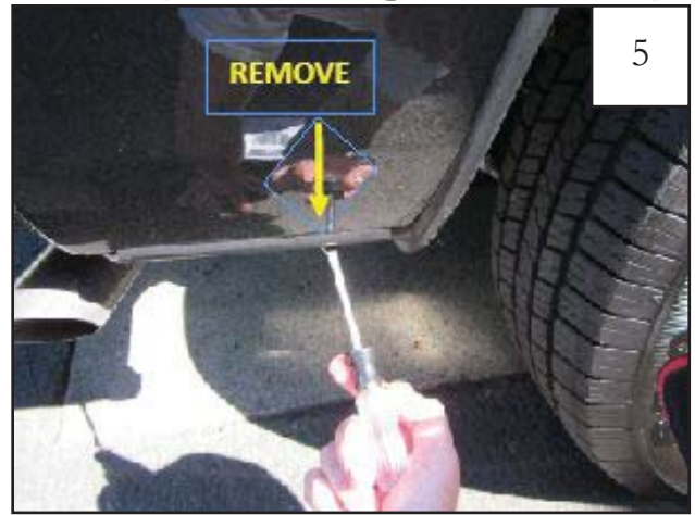
2012 Models Only (Optional): Remove inner piece at bottom rear of wheel well using a pry tool.