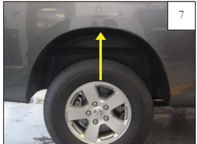
Install Clip (CL1-0022) in this location. See Step 8.