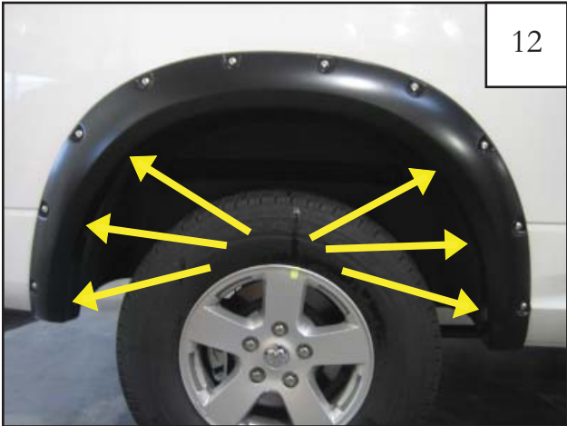
Hold flare in place while you start six supplied screws (SW1-0056) using a Phillips Head Screwdriver. Do not tighten.