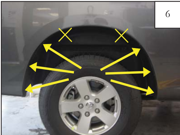
Remove these six factory installed screws using an 8mm socket wrench. X's indicate a factory screw that will not be removed.