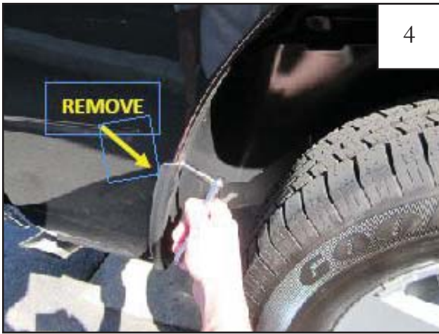
2012 Models Only (Optional): If you encounter a fit problem, remove inner piece at bottom rear and front of wheel well.