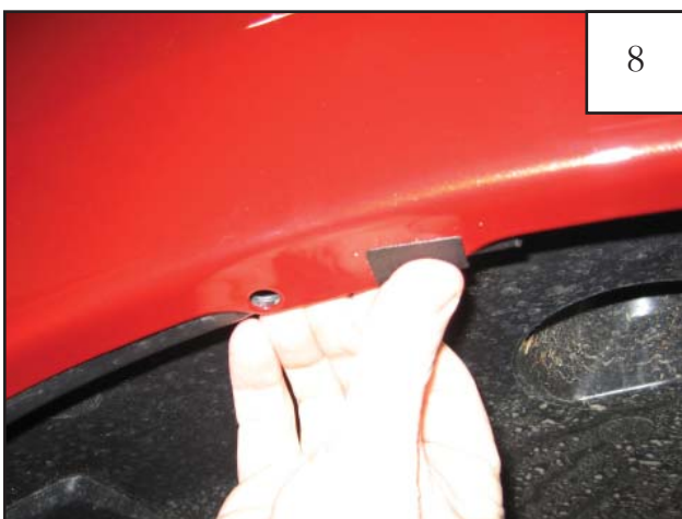
Install plastic tab over existing factory hole.