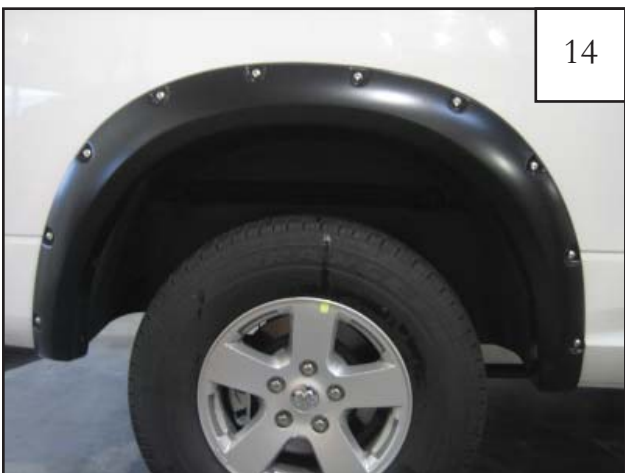
Completed rear flare installation.