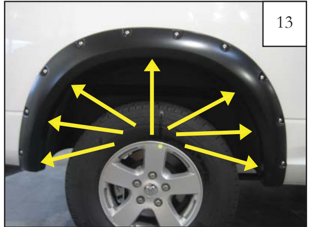
Press firmly on flare and tighten all screws.