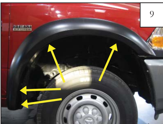
Hold flare to the vehicle and start the factory screws with an 8 mm socket wrench through the factory holes. Do not tighten.