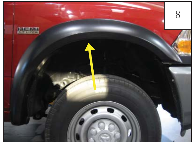
Hold flare to vehicle and start the kit supplied #8x3/4" Washer Panhead Screws with a Phillips screwdriver. Do not tighten.