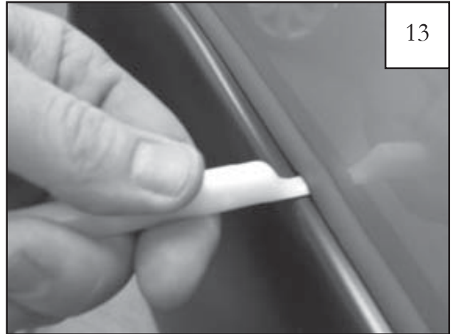
Using flat end of supplied Edge Trim Tool (ET1-0002), seat edge trim against flare by inserting straight end between edge trim and flare at one end. Next, slide around entire edge to the other end.