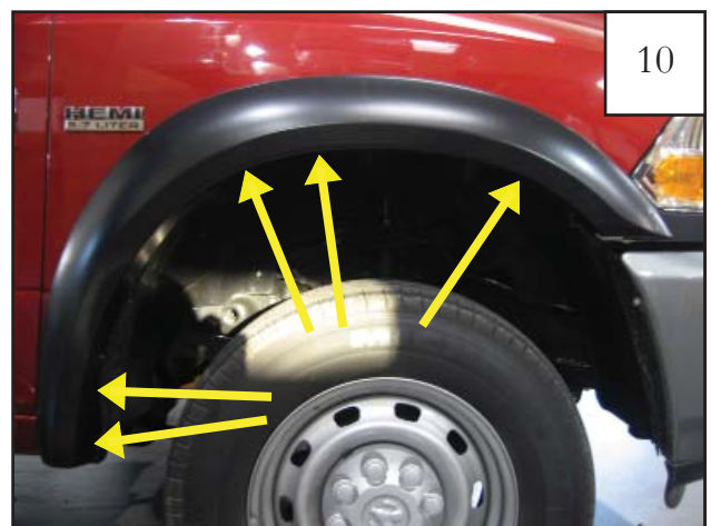
Press firmly on flare and tighten all screws.