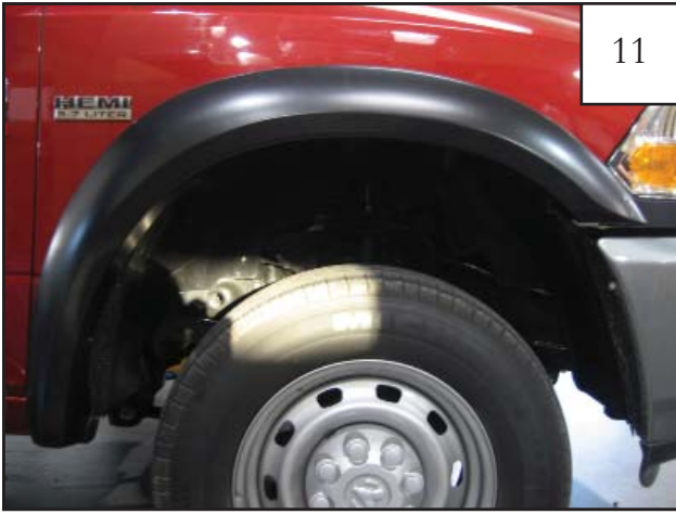
Completed front flare installation.