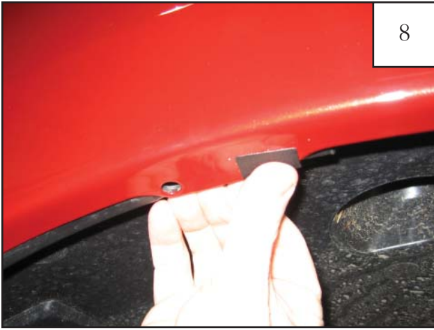
8 Install Tab (MT1-0014) over existing factory hole. There are two holes at the top center location. Refer to step 7 for proper hole for installation.