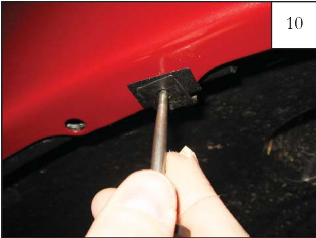
10 Using an awl or similar pointed tool, poke a hole through Tab (MT1-0014) using the Clip (CL1-0022) hole as a guide.